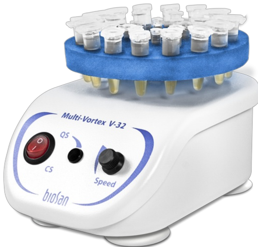
V-32 Including two platforms PV-32, PL-1 Multi-Vortex

Multi-Vortex V-32 is intended for intensive stirring of bacterial and yeast cell, washing from the culture medium and extraction of metabolites and enzymes from cells and cell cultures.