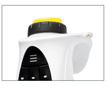
Electronic Tip Ejection Protects you and your hand from Work-Related Upper Limb Disorder by removing the tips effortlessly with an electronic system.

Fast and easy access to up to 10 of your most used pipetting settings by saving them with hotkey.